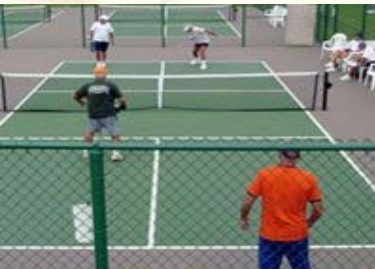
Sebring courts 2008